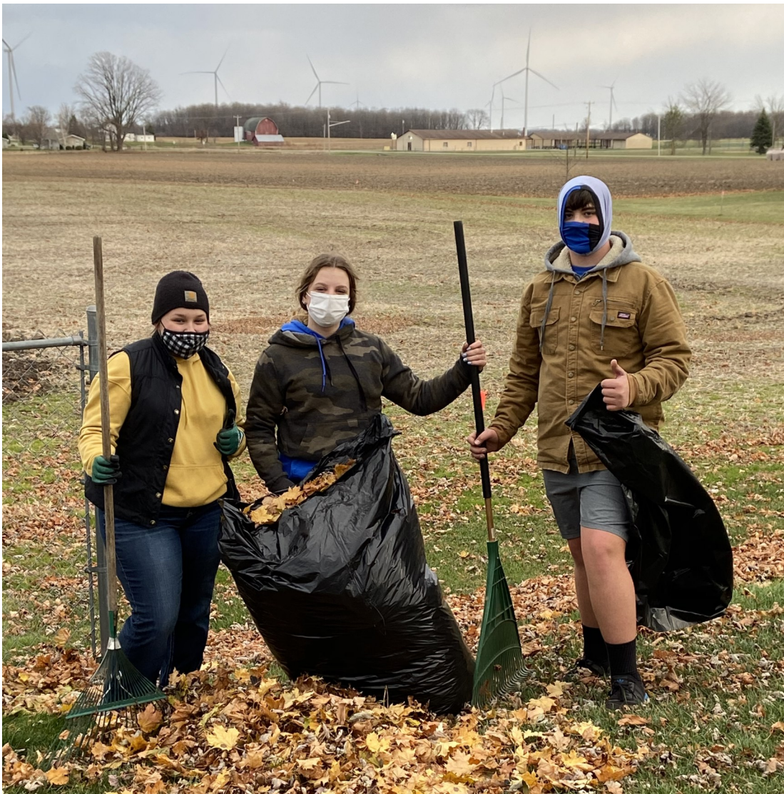
Beal City FFA - Helping rake community members' yard.