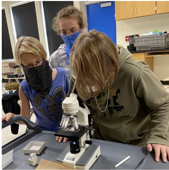
Ag. STEM - Exploring and dissecting a cloudy salmon egg