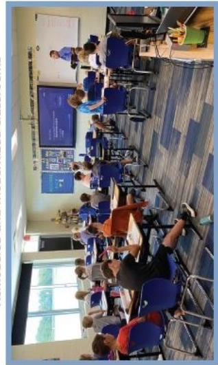
Promoting a world-class learning environment