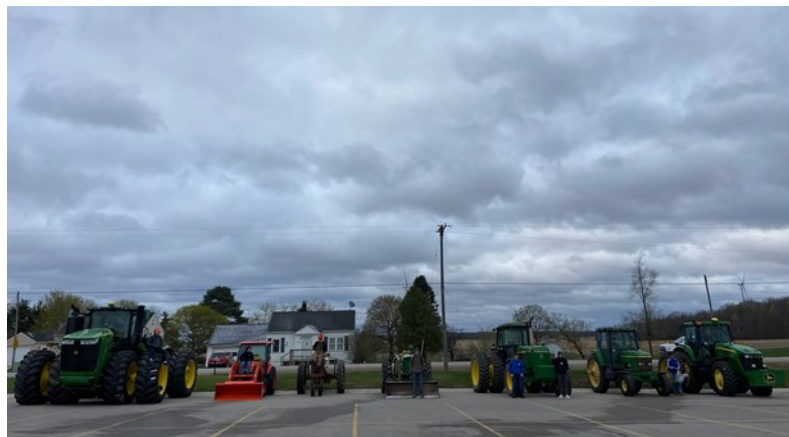
Participants standing next to their tractors.