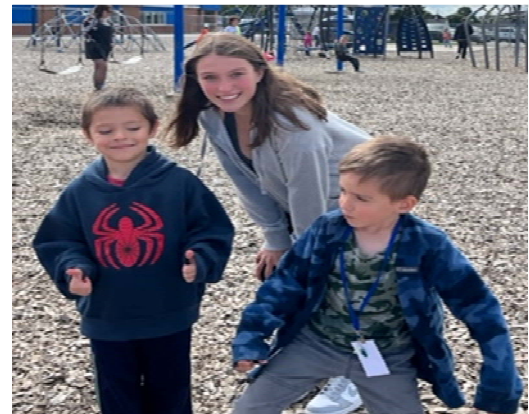
The big buddies are back! Mrs. Crowley's Healthy Living class has continued the mentoring program for a second year and everyone is happy to be back interacting at the elementary. To get acquainted, big buddies opened milk during kindergarten lunch, played GaGa ball with upper elementary students and joined groups of runners on the track for laps. The big buddies take their mentoring role seriously and are there to be positive role models.