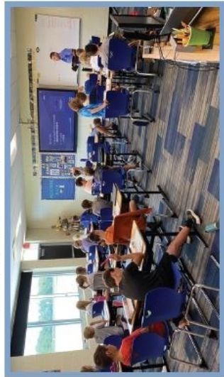
Promoting a world-class learning environment